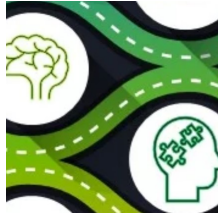
Services & Programs